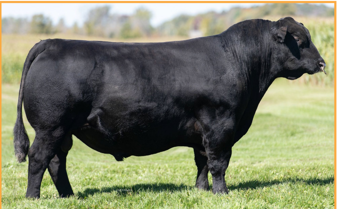
Pine View Mogul