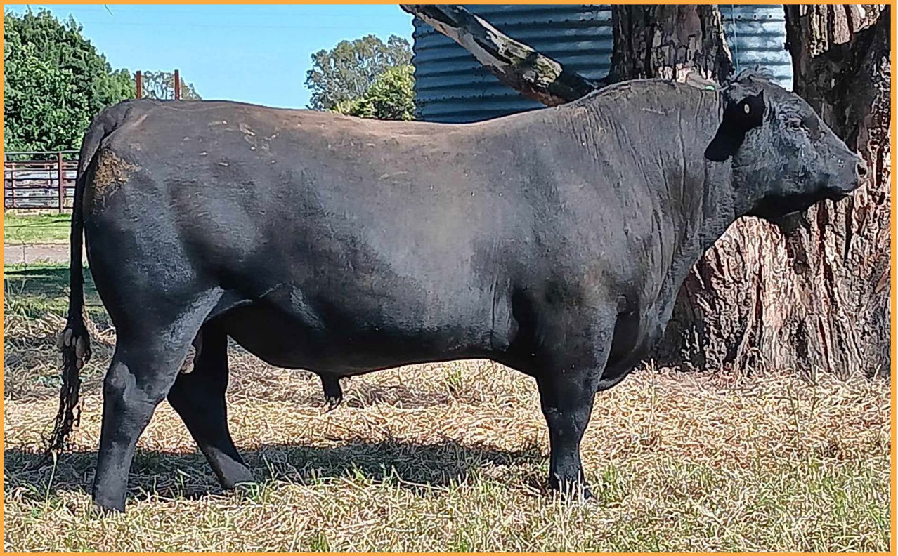
Absolute Newground R61